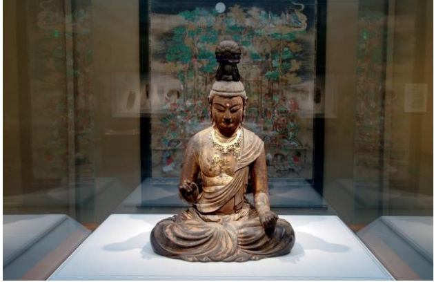
Gallery View, The Religious Art of Japan , Freer Gallery of Art Bodhisattva , by Kaikei Kamakura Period, Japan Wood with lacquer, gold, copper, and crystal Early 13th century Gift of Charles Lang Freer F1909.245