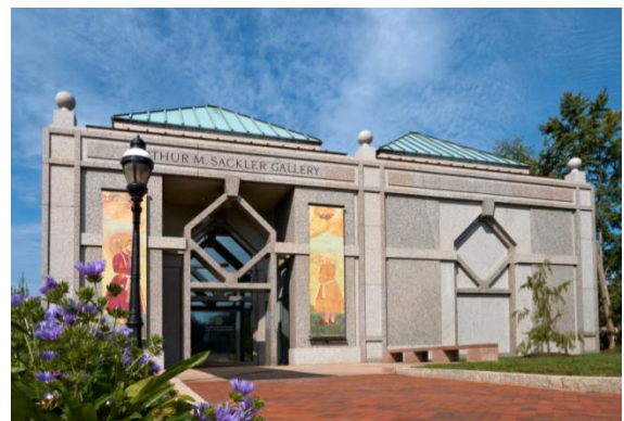
Entrance, Arthur M. Sackler Gallery