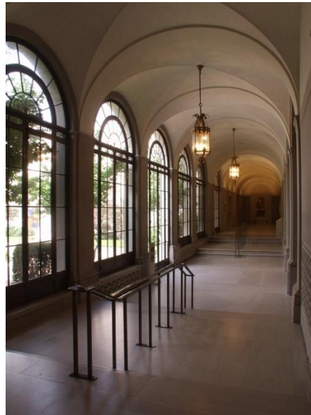
Interior Hallway, Freer Gallery of Art