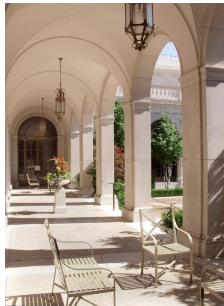
Exterior Loggia View, Freer Gallery of Art