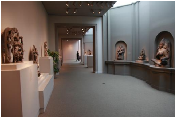
Gallery View, Sculpture of South Asia and the Himalayas , Arthur M. Sackler Gallery