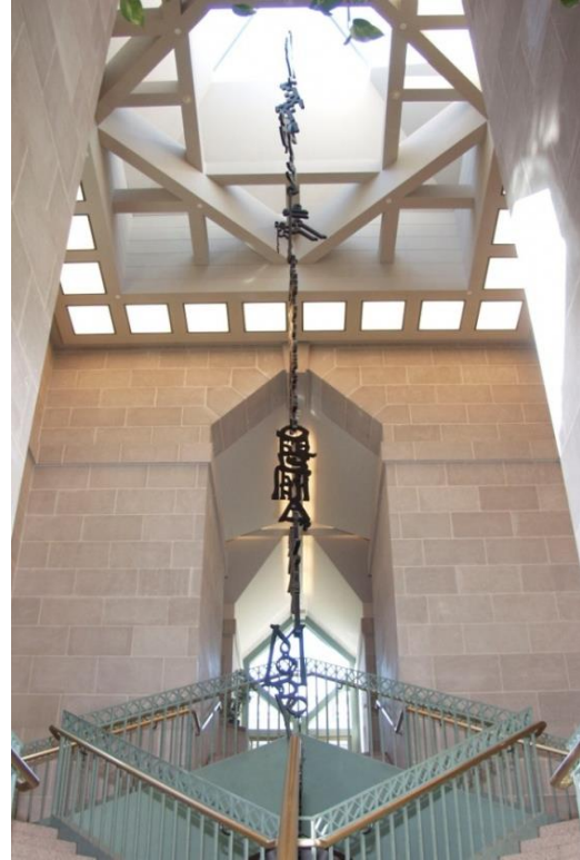
Main Staircase, Arthur M. Sackler Gallery Monkeys Grasp for the Moon Xu Bing (China, active United States, b. 1955) 2004 One of two; lacquer on Baltic birch wood; 2591 x 78 x 4.1 cm Purchase, The Family of Madame Chiang Kai-shek (Chiang Soong Mayling 1898-2003) Arthur M. Sackler Gallery, S2004.1.2-.21