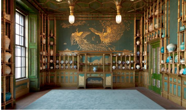
Peacock Room, Freer Gallery of Art James McNeill Whistler (1834-1903) Harmony in Blue and Gold: The Peacock Room 1876—77 Oil paint and gold leaf on canvas, leather, and wood Gift of Charles Lang Freer, F1904.61