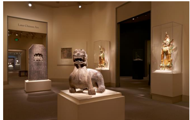
Gallery View, The Arts of China , Arthur M. Sackler Gallery