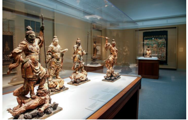
Gallery View, The Religious Art of Japan , Freer Gallery of Art