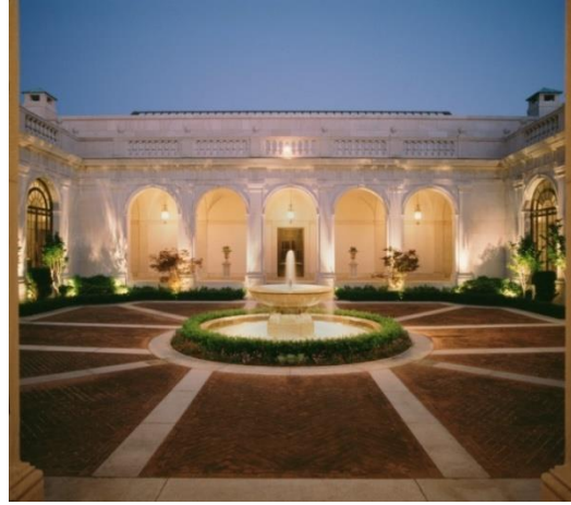
Courtyard View, Freer Gallery of Art at Night