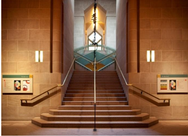
Main Staircase, Arthur M. Sackler Gallery Monkeys Grasp for the Moon Xu Bing (China, active United States, b. 1955) 2004 One of two; lacquer on Baltic birch wood; 2591 x 78 x 4.1 cm Purchase, The Family of Madame Chiang Kai-shek (Chiang Soong Mayling 1898-2003) Arthur M. Sackler Gallery, S2004.1.2-.21