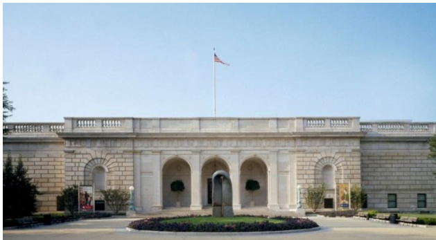
North Entrance View, Freer Gallery of Art