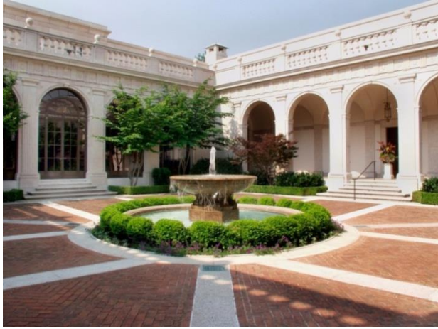
Courtyard View, Freer Gallery of Art