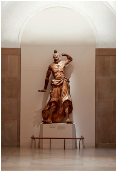
Kongorikishi (also known as Ni-o ) Kamakura period, Japan Early 14th Century Wood Purchase, Freer Gallery of Art F1949.21