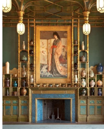
Peacock Room, Freer Gallery of Art James McNeill Whistler (1834-1903) Portrait: La Princesse du pays de la porcelain ( The Princesse from the Land of Porcelain) 1863—65 Oil on Canvas Gift of Charles Lang Freer, F1903.91