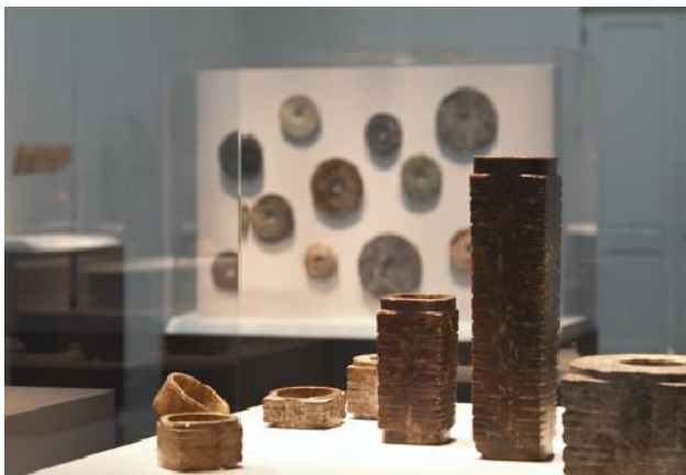
Gallery View, Ancient Chinese Jades and Bronzes , Freer Gallery of Art