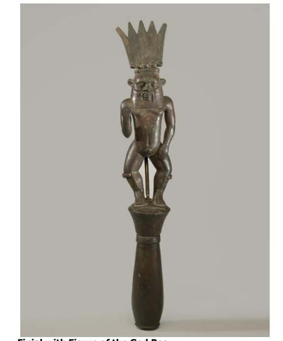
Finial with Figure of the God Bes ca. 1075-656 B.C.E. Bronze Brooklyn Museum Charles Edwin Wilbour Fund, 46.127