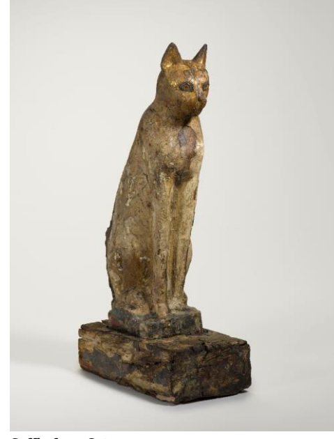
Coffin for a Cat 664–332 B.C.E., or later Wood, gesso, paint, animal remains Brooklyn Museum Charles Edwin Wilbour Fund, 37.1944Ea-b