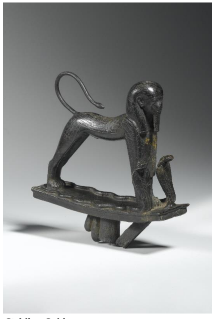
Striding Sphinx 945-712 B.C.E. Bronze Brooklyn Museum Charles Edwin Wilbour Fund, 61.20