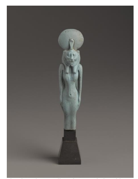
Figurine of a Standing Lion-Headed Goddess 664-30 B.C.E. Faience Brooklyn Museum Charles Edwin Wilbour Fund, 37.943E