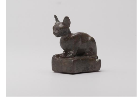
Weight in Form of a Cat 305-30 B.C.E. Bronze, silver, lead Brooklyn Museum Charles Edwin Wilbour Fund, 37.424E