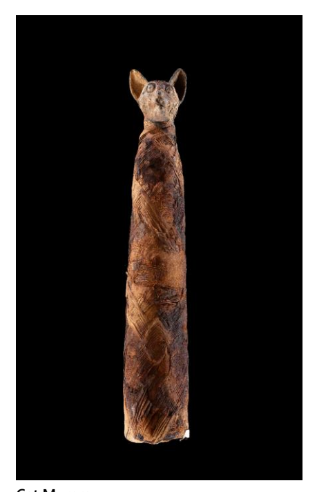
Cat Mummy Catalog number A381570 Department of Anthropology, Smithsonian Institution