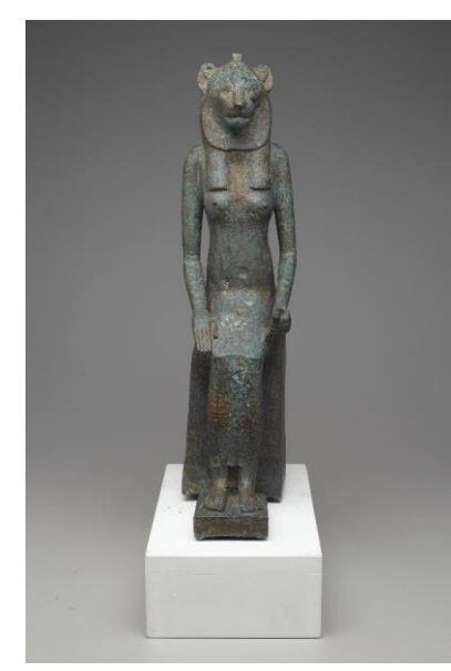
Seated Wadjet 664-332 B.C.E. Bronze Brooklyn Museum Charles Edwin Wilbour Fund, 36.622