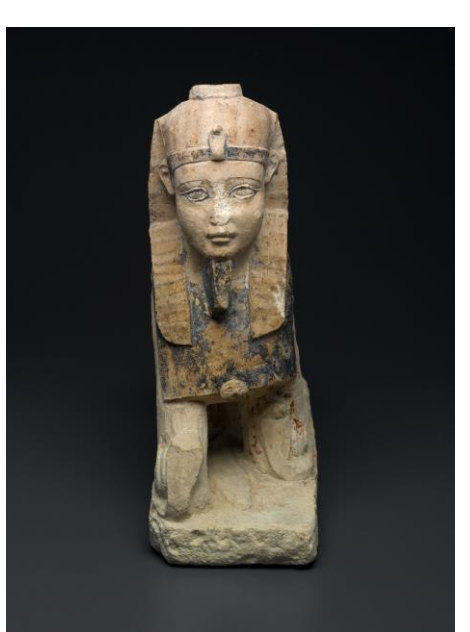
God Tutu as a Sphinx 1st century C.E. or later Limestone, painted Brooklyn Museum Charles Edwin Wilbour Fund, 37.1509E