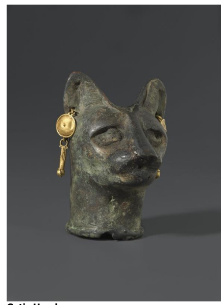
Cat's Head 30 B.C.E. to third century C.E. Bronze, gold, Brooklyn Museum Charles Edwin Wilbour Fund, 36.114

Please contact the Office of Marketing and Communications at 202.633.0271 or pressasia@si.edu for high-resolution images of exhibitions or events. Images are for media use only.