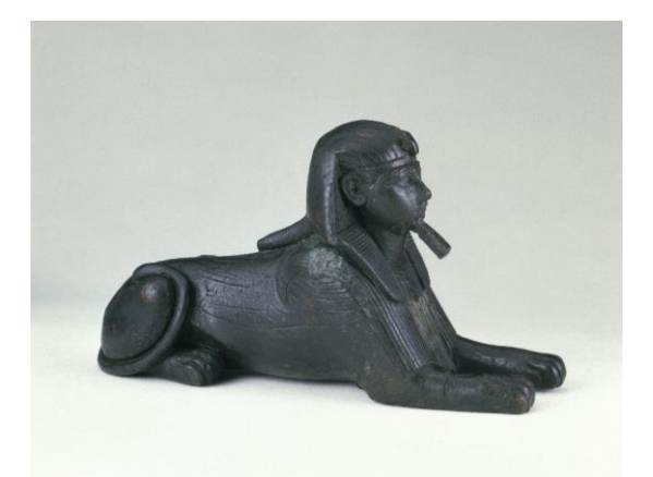
Sphinx of King Sheshenq ca. 945-718 B.C.E. Bronze Brooklyn Museum Charles Edwin Wilbour Fund, 33.586