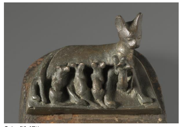
Cat with Kittens ca. 664-30 B.C.E. or later Bronze, wood Brooklyn Museum Charles Edwin Wilbour Fund, 37.406E