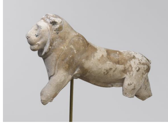
Sculptor's Model of a Walking Lion ca. 664-30 B.C.E. Limestone Brooklyn Museum Charles Edwin Wilbour Fund, 33.190