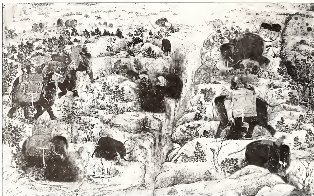
Figure 19. Attributed to Payag, Shah-Jahan and His Sons Hunting Lions . India, Mughal dynasty, late 1650s. Opaque watercolor on paper, 25.5 x 41.7. Keir Collection, London

angle of almost ninety degrees deep into the background, 77 becomes the main subject and ordering force of the composition. Branching off from the perpendicular nullah—like ribs of the spinal column—are the same parallel horizontals used to structure the landscape of Dara-Shikoh’s hunt. They allow the artist to integrate without effort the imperial hunters on their elephants in hierarchically correct side views into the spacious, illusionistic landscape, seen almost in bird’s-eye view from above. Although the nullah is placed off center, the composition is clearly conceived under the influence of that favorite ordering principle of Shah-Jahani art, qarīna , or correspondence, a symmetrical arrangement of features on both sides of an axis with emphasis on the central feature. 78 The structure of the landscape is fleshed out with a similar, though more restrained, naturalistic treatment of surface and texture as the Dara-Shikoh hunt and enlivened by freely painted anecdotal detail in thin, almost monochrome brown brush lines. One notices in particular (above the large buffalo on the left side of the nullah) a hunter being knocked down by a lion, a common motif of Mughal hunting scenes made popular by a famous imperial hunting episode in 1610. 79