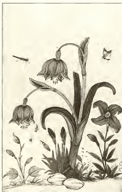
Figure 16. Attributed to Muhammad Khan, Flower Study with Tulips and Insects . India, Mughal dynasty, ca. 1630–35, from the Dārā Shikōh Album , assembled ca. 1633–42. Opaque watercolor on paper, 16.7 x 10.6. British Library, Oriental and India Office Collections, London, Add. Or. 3129, fol. 65b

However, nothing in these elegant and rather cool depictions of plants and birds—which had only further refined an already stylized tradition of nature studies in Mughal miniature painting (fig. 16)—prepares one for the revolutionary naturalism of the landscape of Dara-