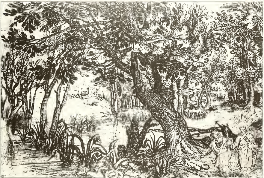
Figure 20. Attributed to Gillis van Coninxloo (1544–1607). Woodscape with Temptation of Christ , 1586. Pen on paper, 19 x 28. Historische Musea—Stedelijk Prentenkabinet, Antwerp (After H. G. Franz, Niederländische Landschaftsmalerei im Zeitalter des Manierismus , Graz, 1969)

A painterly mode of free, open brushwork with no precedent in Islamic or Indian art had already appeared in the formation period of Mughal painting, in particular in several illustrations of the Cleveland