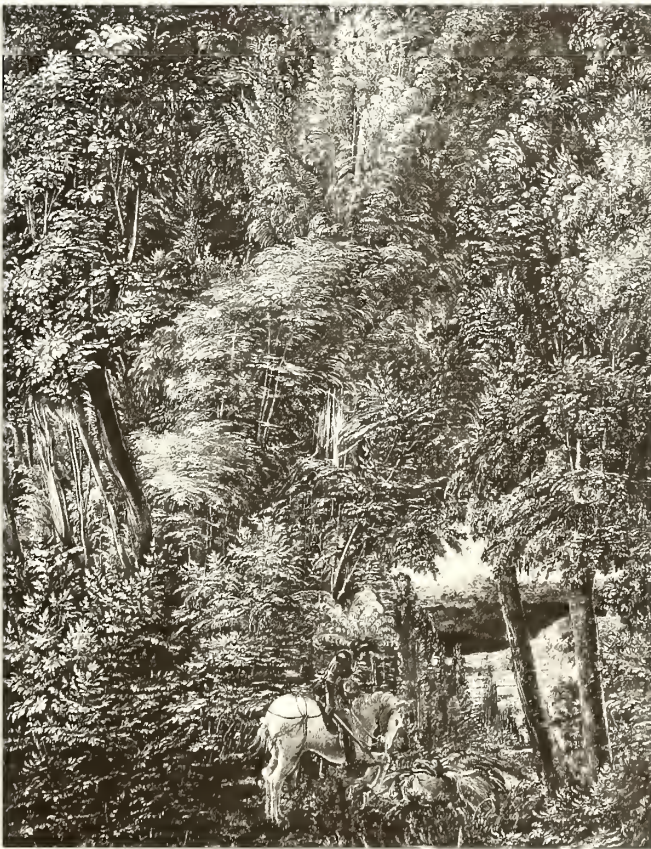
Figure 22. Albrecht Altdorfer (ca. 1480–1538), Forest with St. George and the Dragon , 1510. Oil on parchment attached to a limewood panel, 28.2 x 22.5. Alte Pinakothek, Munich, waf 29