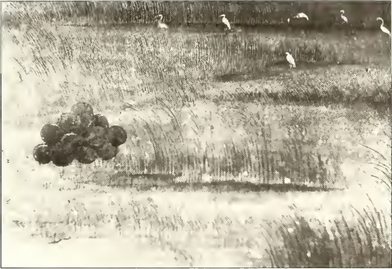
Figure 28. Detail, A Mughal Princess Hunting Game-Birds . India, Mughal dynasty, ca. 1660, from the St. Petersburg Album. Opaque watercolor on paper, 32.4 x 47.6. Purchase—Anonymous donor and the Friends of Asian Arts, Freer Gallery of Art, Smithsonian Institution, F1994.4