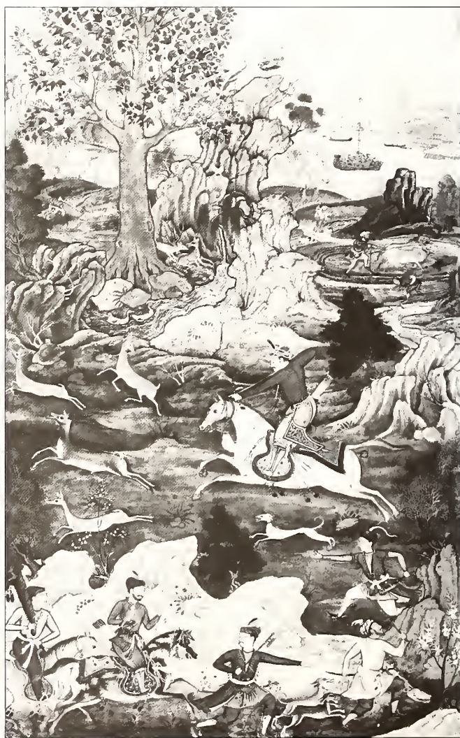
Figure 24. Mukund, Faridun, and the Gazelle , from a Khamsa of Nizāmi. India, Mughal dynasty, 1595. Opaque watercolor on paper, 17.2 x 10.7. British Library, Oriental and India Office Collections, London, Or. 12208, fol. 19a