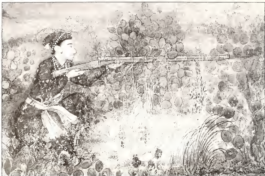
Figure 9. Detail, fig. 5, Dara-Shikoh firing a bullet from his matchlock gun.