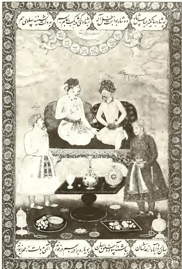
Figure 1. Jahangir Entertains Shah 'Abbas , from the St. Petersburg Album. India, Mughal dynasty, ca. 1618. Opaque watercolor and gold on paper, 25 x 18.3. Freer Gallery of Art, Smithsonian Institution, F42.16