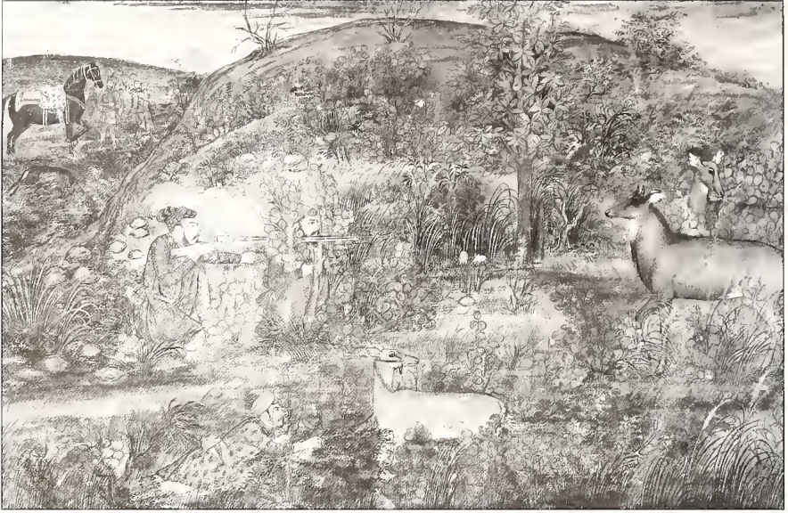
Figure 6. Attributed to Payag, Shah-Shuja' Hunting Nilgais . India, Mughal dynasty, ca. 1655. Opaque watercolor on paper, 16.8 x 26. Museum of Art, Rhode Island School of Design, Providence, Museum Works of Art Fund, 58.068

camouflage while positioning himself with his matchlock gun, the barrel of which rests on a fork (fig. 9). (The pose of the prince can be better understood when compared with figure 10, a drawing in the Chester Beatty Library, datable to the 1620s, showing his father, Shah-Jahan, in a similar position taking aim with his matchlock). 39 Dara-Shikoh has just fired a shot at the nilgai bull. Hit in the shoulder, the bull drops mortally wounded, while his tan-colored female bounds to escape.