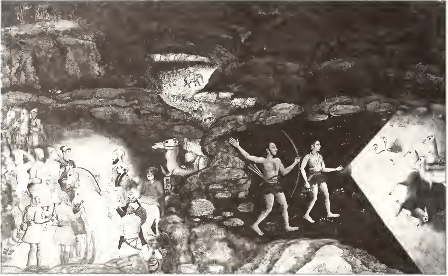
Figure 15. Royal Hunters and Tribal Hunters in a Nocturnal Landscape. India, Mughal dynasty, late 17th century. Opaque watercolor on paper, 22.5 x 36.6. Keir Collection, London

the deer, while the light would dazzle it and allow the hunter to take it down with a bow.