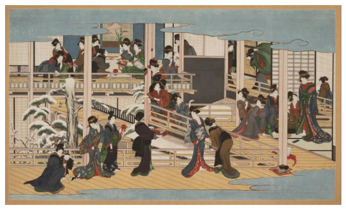
Snow at Fukagawa Kitagawa Utamaro (1753–1806) Japan, Edo period, ca. 1802–6 Hanging scroll; color on paper Okada Museum of Art Hakone, Japan