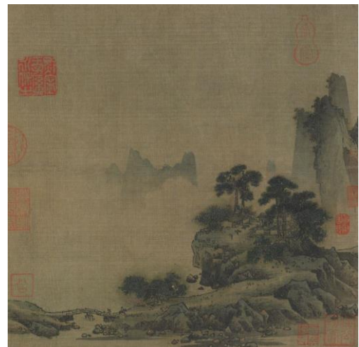
Hostelry in the Mountains

Gift of Charles Lang Freer, Freer Gallery of Art, F1911.168