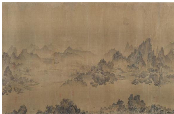
Ten Thousand Li Along the Yangzi River

Images are for press and media use only. Please call or e-mail the F|S Public Affairs and Marketing office at (202) 633-0271 or PressAsia@si.edu for access to hi-res images for exhibitions or events.