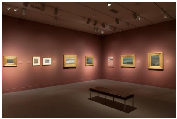
Gallery view, "An American in London: Whistler and the Thames," Arthur M. Sackler Gallery, Smithsonian.