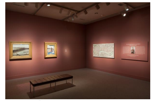
Gallery view, "An American in London: Whistler and the Thames," Arthur M. Sackler Gallery, Smithsonian.

Images are for press and media use only. Please call or e-mail the F|S Public Affairs and Marketing office at (202) 633-0271 or <a href="mailto:pressAsia@si.edu">pressAsia@si.edu</a> for access to hi-res images for exhibitions or events.