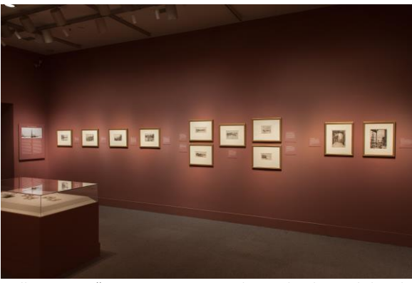
Gallery view, "An American in London: Whistler and the Thames," Arthur M. Sackler Gallery, Smithsonian.