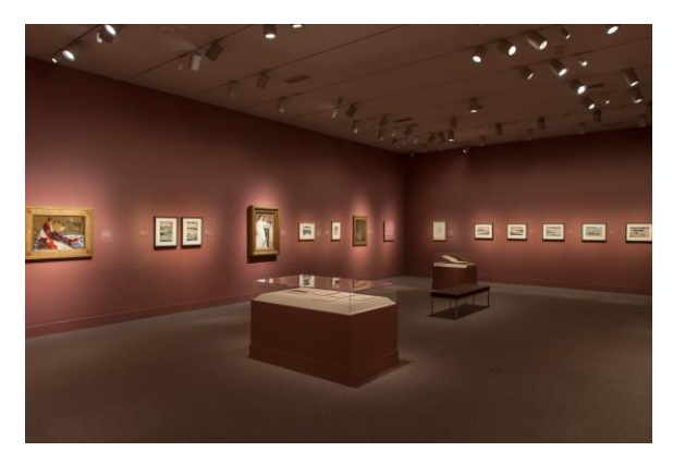
Gallery view, "An American in London: Whistler and the Thames," Arthur M. Sackler Gallery, Smithsonian.