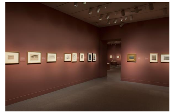
Gallery view, "An American in London: Whistler and the Thames," Arthur M. Sackler Gallery, Smithsonian.