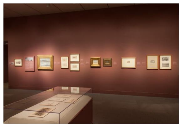
Gallery view, "An American in London: Whistler and the Thames," Arthur M. Sackler Gallery, Smithsonian.