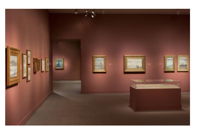
Gallery view, "An American in London: Whistler and the Thames," Arthur M. Sackler Gallery, Smithsonian.