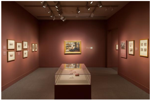
Gallery view, "An American in London: Whistler and the Thames," Arthur M. Sackler Gallery, Smithsonian.