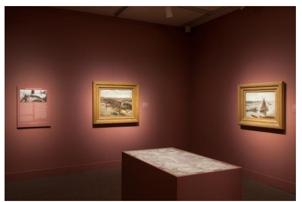
Gallery view, "An American in London: Whistler and the Thames," Arthur M. Sackler Gallery, Smithsonian.