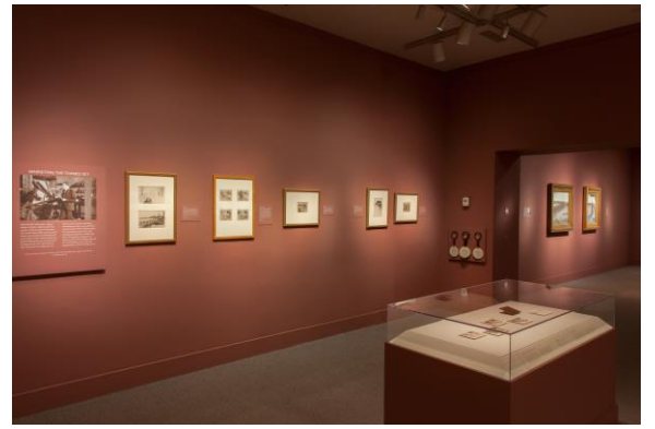
Gallery view, "An American in London: Whistler and the Thames," Arthur M. Sackler Gallery, Smithsonian.